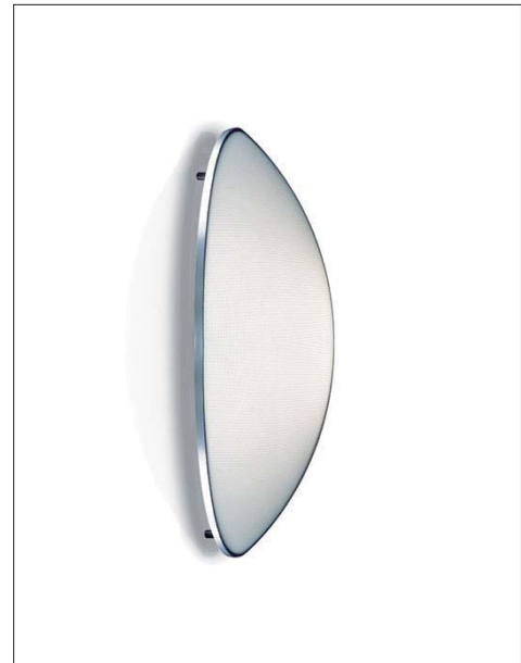
D14 a. - D14 a.fe

Reference code: D14 a. 1D14A0000020 alu D14 a.pi. 1D14A1PI0020 alu